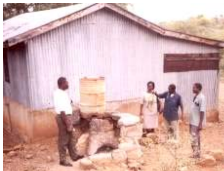
At Mogoswok Refinery with the Chairman and a member of the New Mogoswok Beekeeping Society, Baringo District

Hence, it is a worthwhile move to ensure that our bee products attract competitive prices. This will aid in alleviating the penury of our farmers who have habitually been pathetic victims of blackmail.