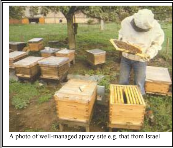
A photo of well-managed apiary site e.g. that from Israel

Simultaneously, the increased presence of bees could lead to better pollination of both tree and field crops and thus to greater timber, fruit and crop yields. The latter, along with honey yields, would bring farmers, like Akite and Mzee Mwani, increased cash income with which to purchase, among other household needs like sugar and food, modern beekeeping equipment.