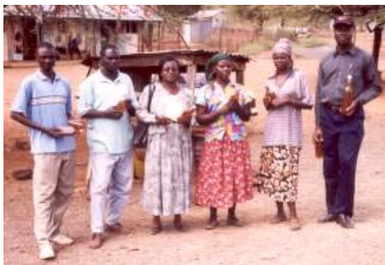
The survey team flanked by Radat Honey Vendors